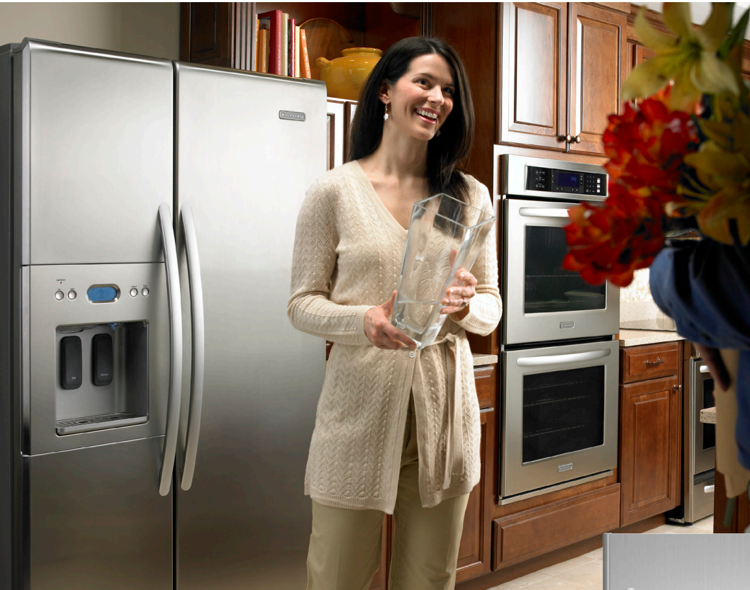
Cabinetry by Shenandoah Cabinetry®. Zodiac® Quartz Surface by DuPont.

Two great design options make this refrigerator an exceptional choice. The refrigerator is 24 inches deep – leaving the cabinet flush to countertops and cabinets. And, having the freezer on the bottom makes it easy to access your fresh food. Choose either a right-hand or left-hand door swing.