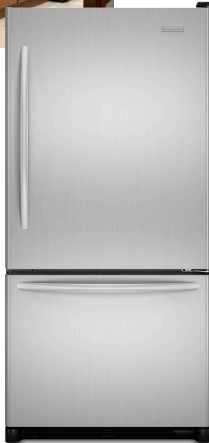
Stainless Steel KBRS20ETSS