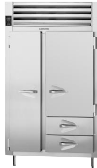
Dual-Temp Model UR48DT (shown as supplied standard)